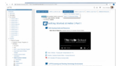
Trial and Error: Online Prep for Face-to-Face Programs