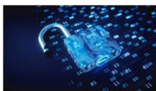
Helping Institutions Reach Accessibility Goals